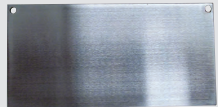
After 192 hours in a humidity cabinet, the metal coupon treated with Z-ROD Synthetic Motor Oil showed no signs of rust or corrosion.