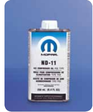
ND-11 A/C COMPRESSOR OIL POE TYPE Formulated for use only in electrically driven compressors. 250 mL Can MSQ: 1 Can Part No. 68043289AA