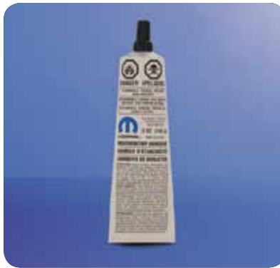
WEATHERSTRIP ADHESIVE Adheres weatherstripping to painted metals for a permanent bond. Withstands heat and freezing conditions; also resists gasoline, kerosene, antifreeze and most solvents. 5 Oz. Tube MSQ: 10 Tubes Part No. 04773774 MS-CC223