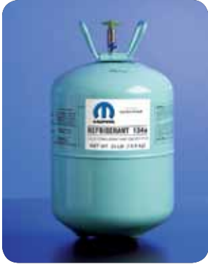
R-134A A/C REFRIGERANT Convenient 30 lb. non-returnable container. 30 lb. Cylinder MSQ: 30 (unit of measure represents lbs.) Part No. 82300101AB