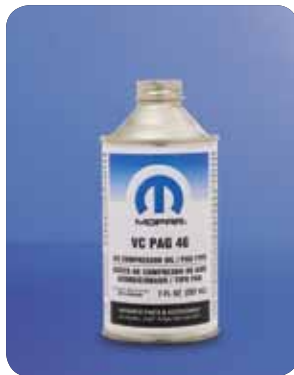
VC-PAG 46 A/C COMPRESSOR LUBRICANT Specifically intended for use in Visteon air conditioning compressors. 7 Oz. (210 mL) Can MSQ: 1 Can Part No. 05114554AB