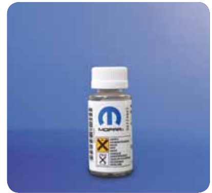
WEATHERSTRIP LUBRICANT Unique Krytox (synthetic fluorinated lubricant) formulation lubricates weatherstripping to prevent it from sticking to door glass and frames. Clear fluid provides long-lasting lubrication. Will not stain or mar clothing. Features built-in sponge applicator. 1 Oz. Bottle MSQ: 1 Bottle Part No. 04773427