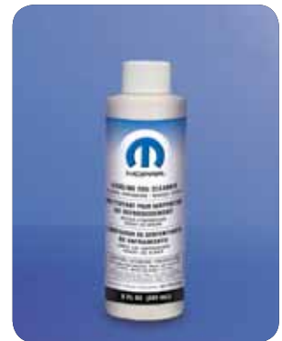
COOLING COIL CLEANER* Heavy-duty, fast-acting cleaner. Removes dirt and odor-causing organic matter. Biodegradable, safe on automotive surfaces. 8 Oz. Bottle MSQ: 12 Bottles Part No. 05170022AA