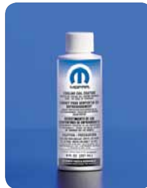
COOLING COIL COATING* Provides a durable coating to the air conditioning evaporator to reduce or eliminate odors. 8 Oz. Bottle MSQ: 6 Bottles Part No. 04728942AB