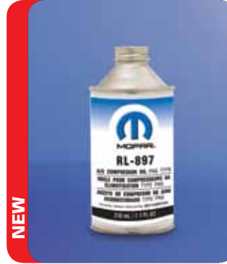
RL-897 A/C COMPRESSOR OIL PAG TYPE Formulated for use only in electrically driven compressors. Do not mix with other PAG type compressor lubricants. 210 mL Can MSQ: 1 Can Part No. 68170681AA