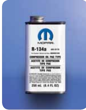
R-134A COMPRESSOR OIL PAG TYPE 250 mL Can MSQ: 1 Can Part No. 82300102