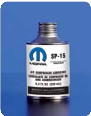
SP-15 A/C COMPRESSOR LUBRICANT 250 mL Can MSQ: 1 Can Part No. 04886129AA