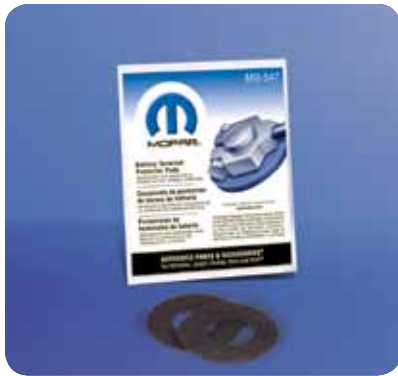
BATTERY TERMINAL PROTECTOR PADS 2 Pads MSQ: 25 Pouches Part No. 68048547AA