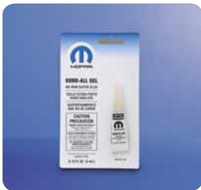
BOND-ALL GEL Super adhesive glue instantly bonds a wide variety of materials. Thick, no-run glue for use on weather stripping, bumper rub strips, body side moldings and many other items where permanent repair is needed. .06 Oz. Tube MSQ: 10 Tubes Part No. 04467709 MS-CC15E