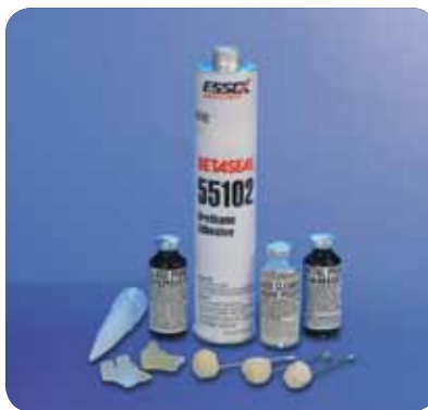
WINDSHIELD INSTALL PACKAGE Contains: Tube Urethane Adhesive (10.5 oz), Metal Primer (1.1 oz), Glass Primer (1.1 oz), Application Dauber (1), Foam Spacers (10), and Windshield Supports (2). MSQ: 1 Part No. 04864015AB